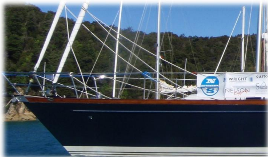
New Zealand's premier two handed yachting event starts Saturday February 19 2011

Wright Satellite Connections (WSC) is proud to have provided the 2011 Round North Island Two Handed Race with satellite communication & safety equipment.